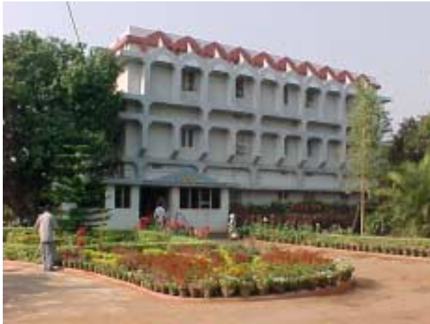
Srikiran Institute of Ophthalmology

The main objective of Srikiran Institute of Ophthalmology (Srikiran) is the elimination of preventable and curable blindness. Srikiran’s policy is that no one will be denied access to eye care services for not being able to pay, and the quality of services must remain at the same high standard for all.