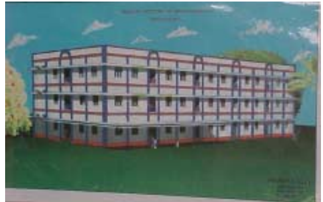
New Hospital Building (Under Construction)

Recognizing this need, a project has been initiated to construct a new building and equip it with state of the art diagnostic and surgical equipment. The new building will provide more outpatient areas, operation theatres, wards, and specialty clinics like cornea, glaucoma, retina and pediatric units.