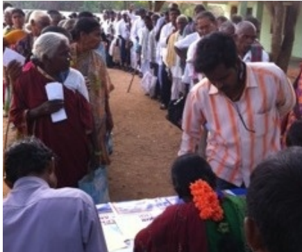
Srirama Mangapuram Thanda Eye Camp, February 19, 2013.